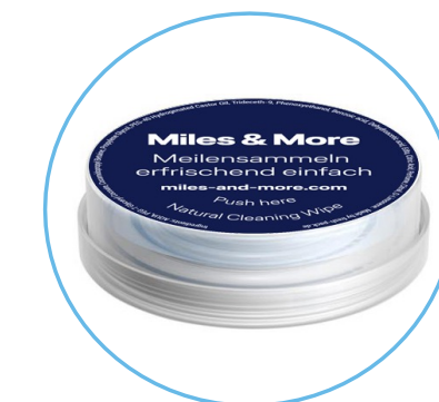
Miles & More